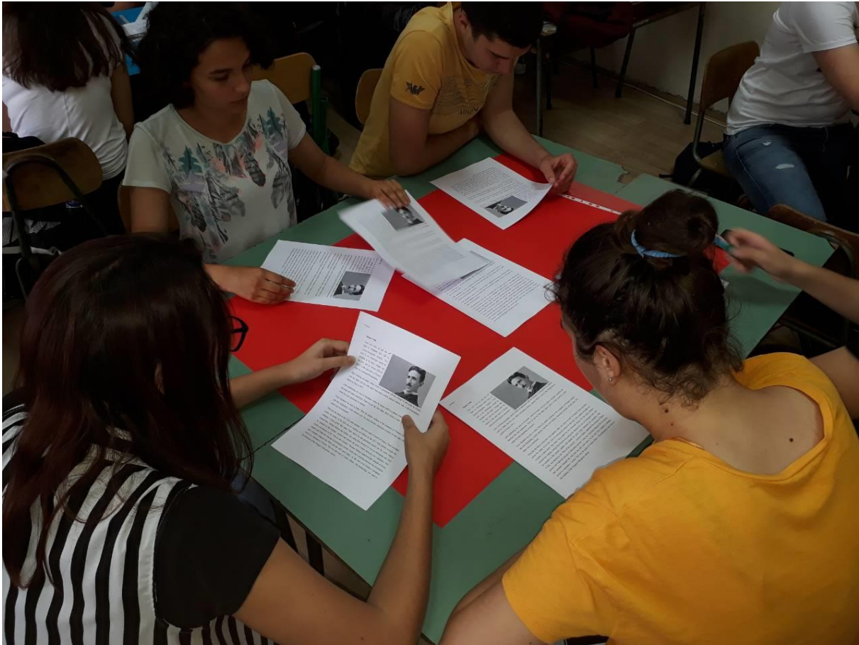
Piloting of resources for the Strategies for Inclusion project

EUROCLIO is working on its mission through various activities. Here is an overview of the highlights from 2018