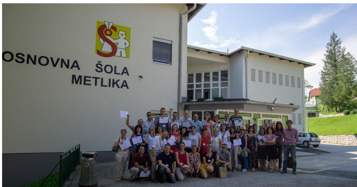
2018 Regional Summer School in Metlika, Slovenia