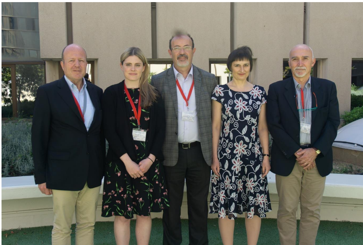
The 2018 Board pictured together during the 25 th Annual Conference in Marseille, France

The Board of EUROCLIO is tasked with the overall responsibility for governing the organisation and ensure wide and successful implementation of its core mission. Elected individuals act as Board Members support EUROCLIO's Management on issues related to financial policy and governance and oversee the Secretariat in a monitoring and accountability role.