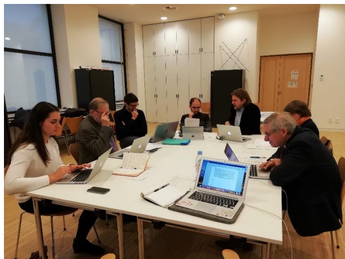
The Historiana Editors' team at work

In 2018, EUROCLIO finalised learning resources that were designed to make history and citizenship education more inclusive and accessible. These resources focus on a range of topics and different time period, and together show how the resource can be adapted to different learner needs. Some of these resources are translated into Armenian, Dutch, Norwegian and Slovenian. EUROCLIO also created a series of transnational source collections and eLearning