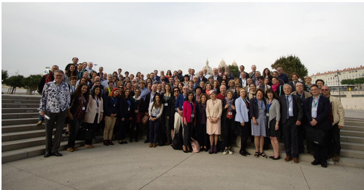
2018 Annual Conference participants, Marseille

They were supported by the following Volunteers, Trainees and Research Trainees: