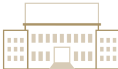
House of European History