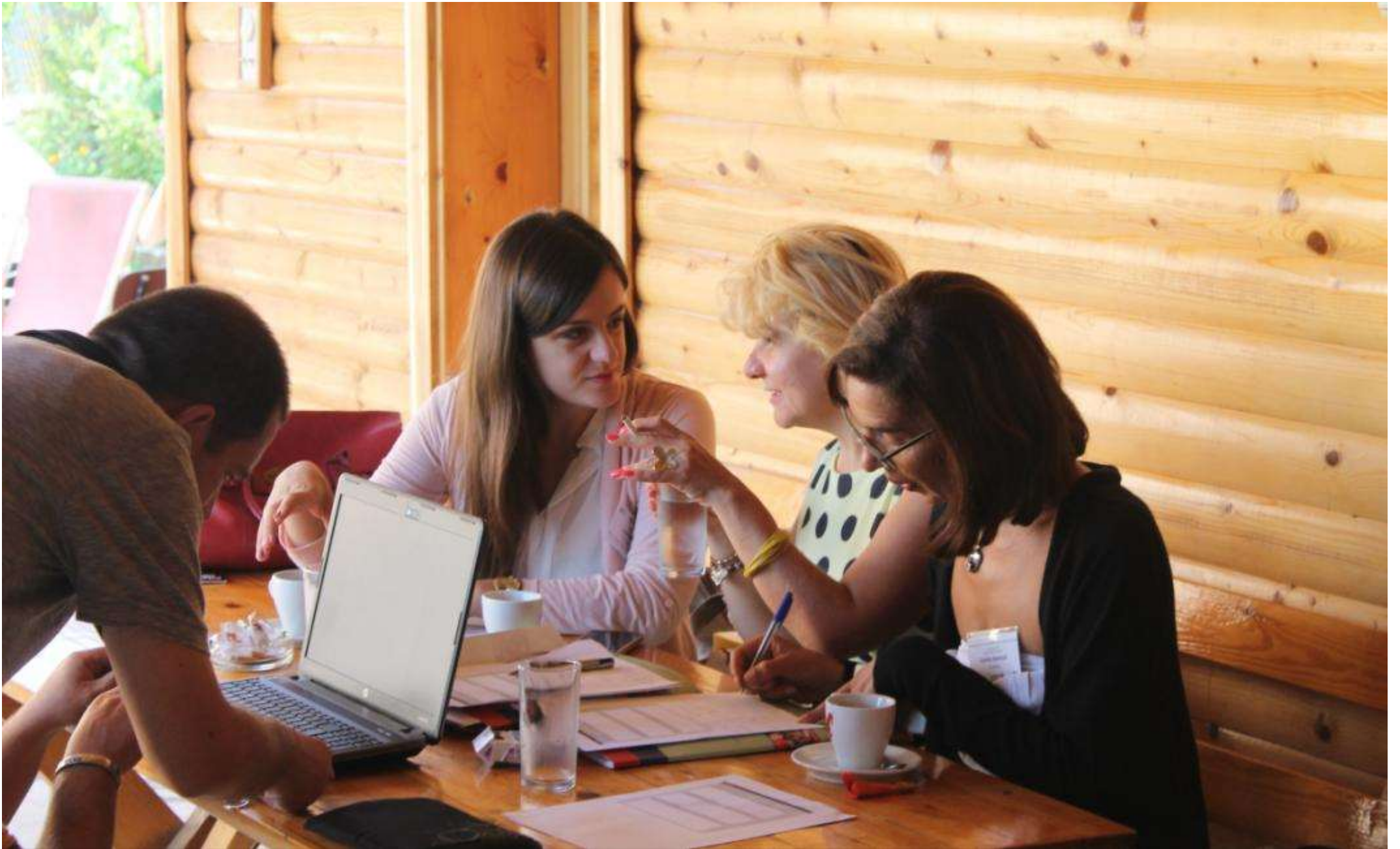
Participants working together in the “Making On – Site Learning Engaging!” Workshop