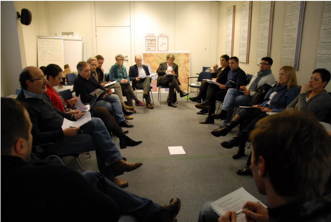
Discussions during the 'History: The Elephant in the Room of Intercultural Dialogue?' event