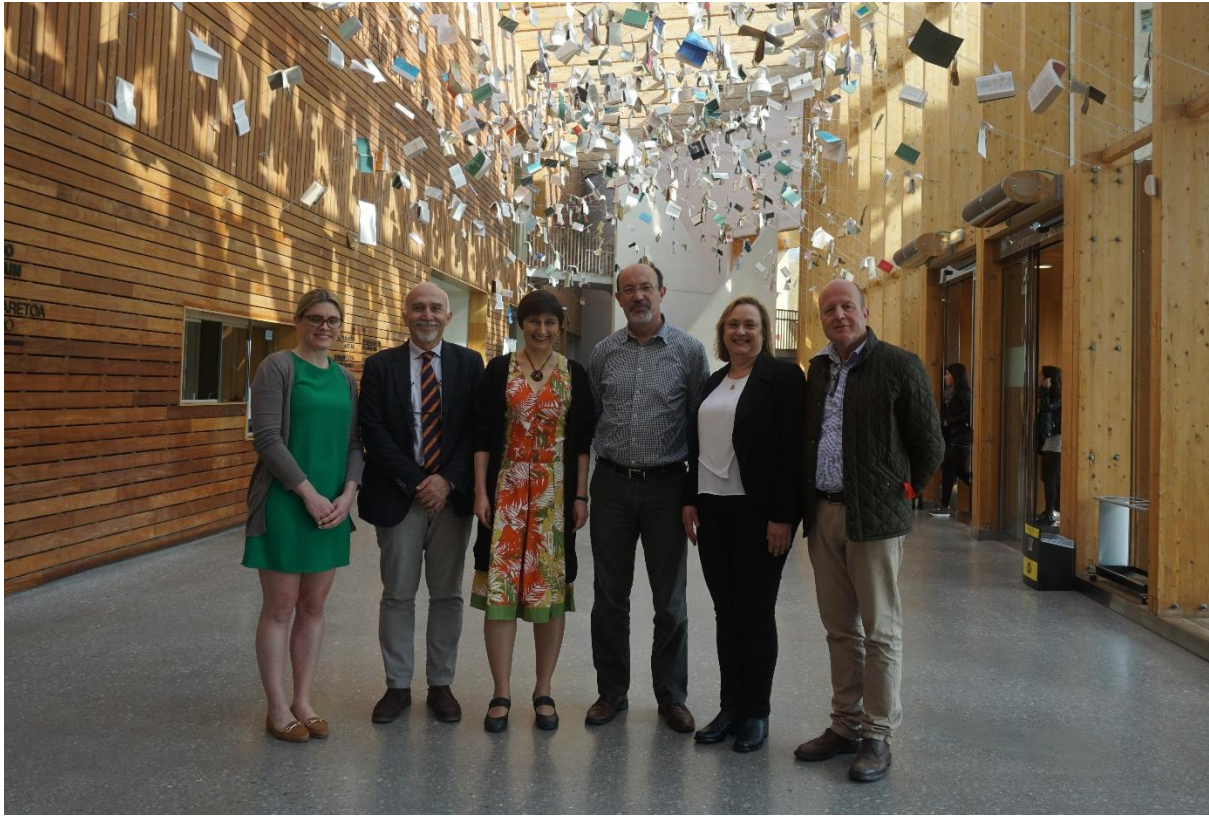
The 2017 Board pictured together during the 24 th Annual Conference