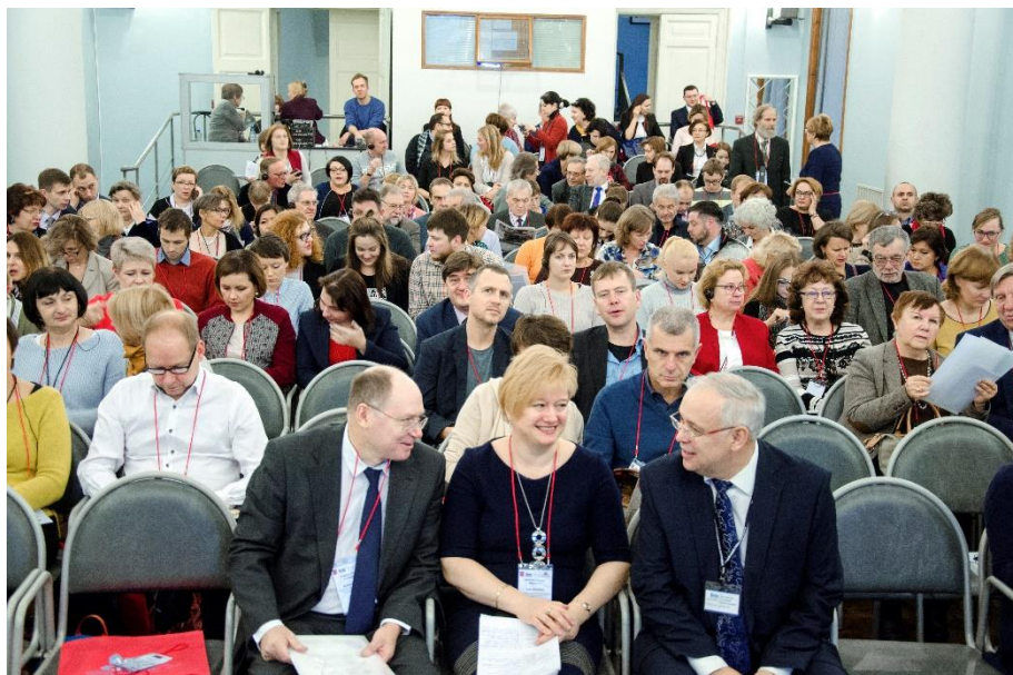
Participants from the thematic seminar in St. Petersburg

Later in October a thematic seminar was organised in St. Petersburg on the centenary of the Russian Revolution, a first time revisit to Russia since our last joint project in 2005, and reconnecting with the local network we had originally helped create between 1995-2005 over numerous large country-wide projects.