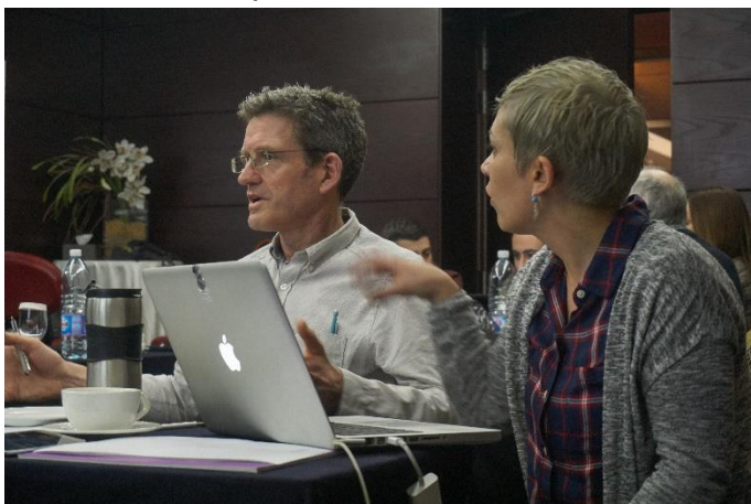
Working on cross-border educational resources in Lebanon

Cross-border teaching materials were developed during a special project__with members and partners from Cyprus, Lebanon, Jordan and Turkey.