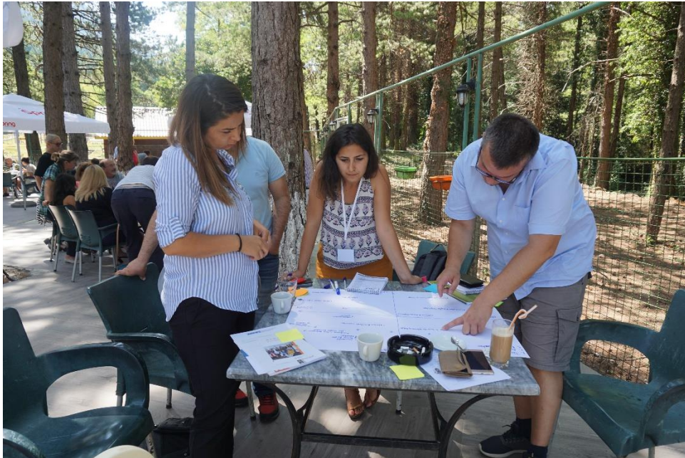
Participants of the Albania Summer School brainstorming in the sunshine

which is the result of an OSF project (Rethinking History Education in the Western Balkans).