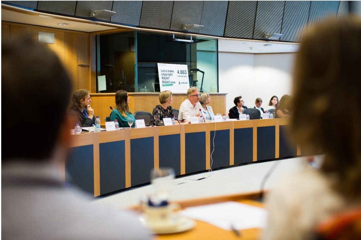
Discussions about copyright in the classroom with the European Commission