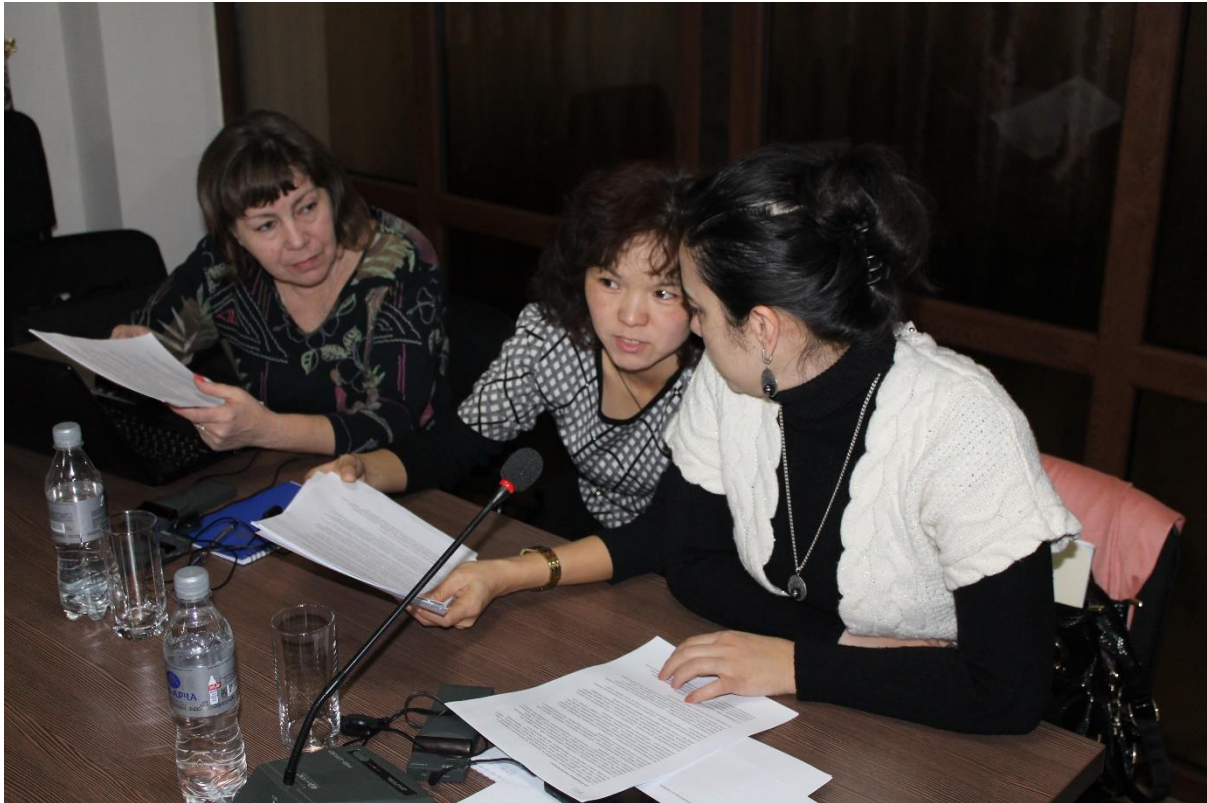
EU-Kyrgyzstan training session