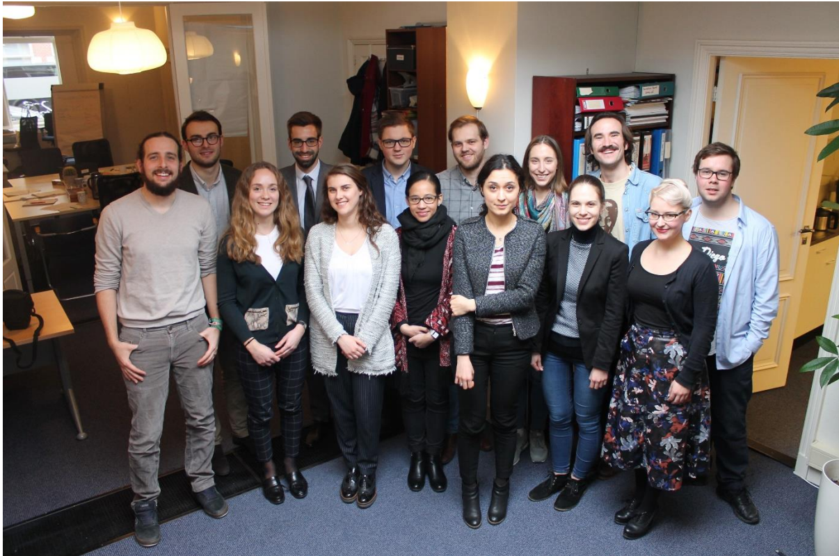
Staff and trainees from the EUROCLIO Secretariat in 2017