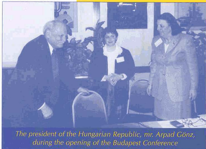
The president of the Hungarian Republic, mr. Arpad Gönz, during the opening of the Budapest Conference

* Riga, Latvia. Consultancy on behalf of the Council of Europe to discuss the history test in the naturalisation examination for non-Latvian speaking in Latvia.