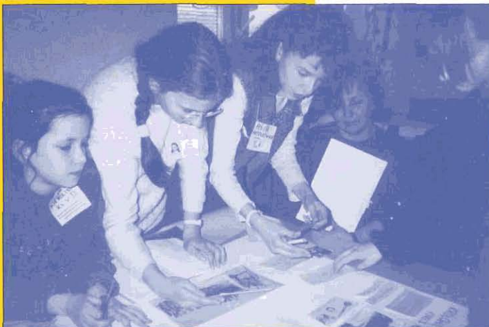
School visit in the Kreator project in Poland

Membership in the Steering Committee for the Council of Europe 1997-2000 History project 'Learning and Teaching about the History of Europe in the Twentieth Century History in Secondary Schools'. Aim is to provide history educators with teaching materials, in-service courses, seminars, networks and a teachers guide with practical advice and examples of innovatory approaches in history education. The Council of Europe wants to reinforce the interest of young people in secondary schools in the recent history of their continent.