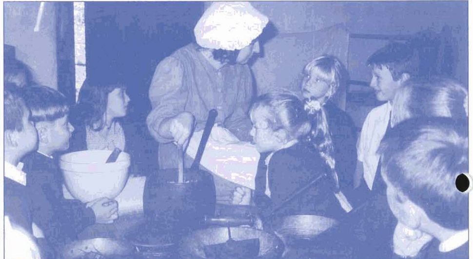
An example of active learning during the Historical Association Conference in England