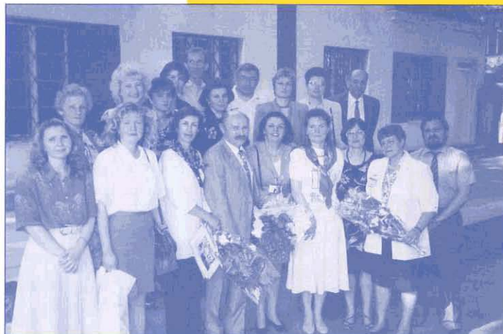
Meeting of Euroclio with members of DOBA, the Ukrainian Association