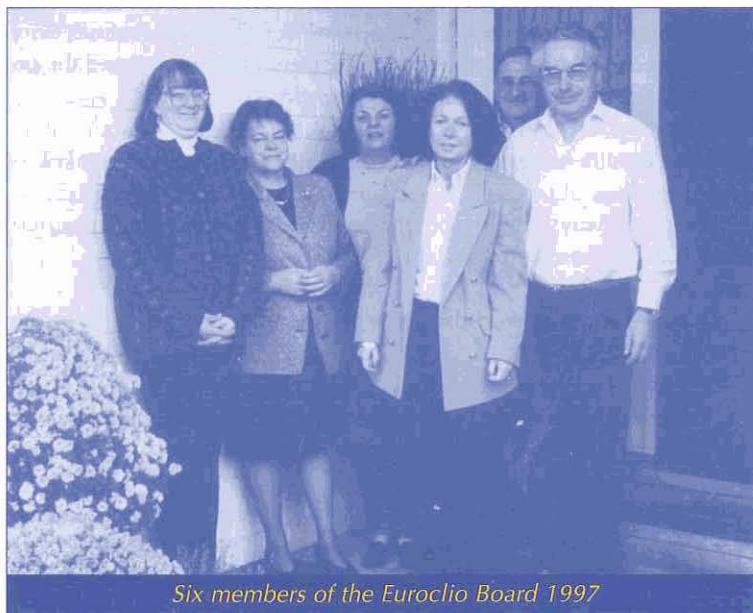
Six members of the Euroclio Board 1997

Vandepitte, P., 'Une structure d'information pour les élèves dans l'enseignement de l'histoire en secondaire', Concepts, modèles, raisonnements. Acts du Colloque . Institut National de Recherche Pédagogique, ed., (1997)