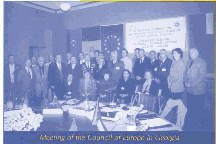
Meeting of the Council of Europe in Georgia