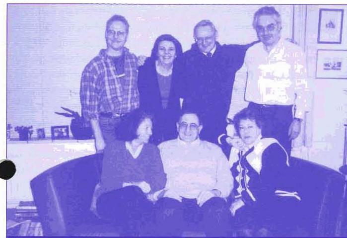
EUROCLIO Board 1996

March 21-24, 1996 General Assembly and conference on: 'History teaching: a key to democracy?' in Neuchâtel, Switzerland. This conference was organised under the patronage of the Council of Europe. EUROCLIO members from France, Norway, Portugal and Poland talked about the question: 'What are the relations between history education and democracy?' Other lectures were given by