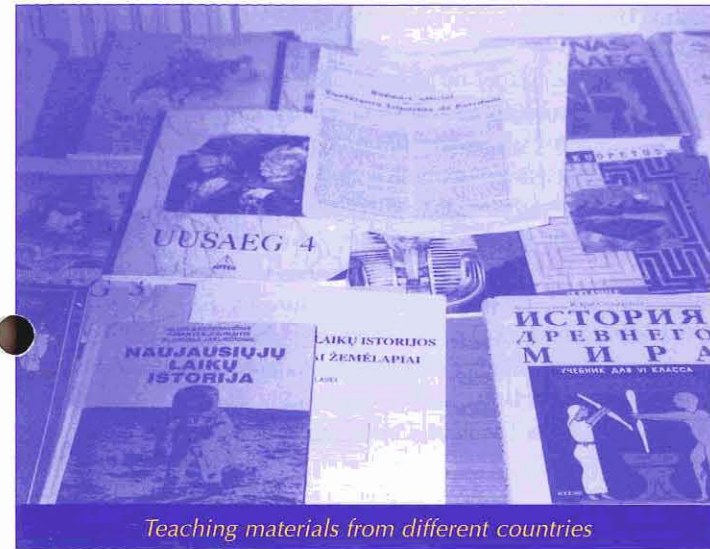
Teaching materials from different countries

What makes a good textbook? Reflections on the use and writing of history textbooks in Europe , The European Standing Conference of History Teachers Associations (EUROCLIO), Council of Europe, Council for Cultural Cooperation ed., (Strasbourg, 1996) CC-ED/HIST (96) 10.