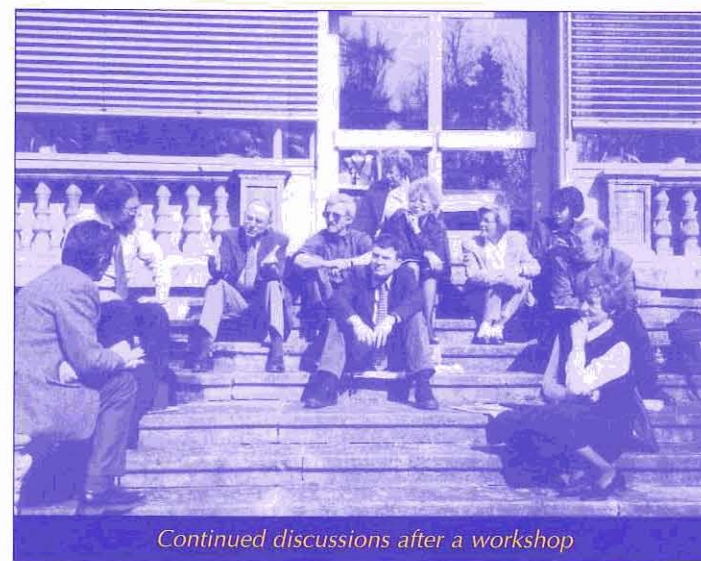
Continued discussions after a workshop

Croatia : History Teachers Association of Croatia Czech Republic : History Teachers Association of the Czech Republic Denmark : Dansk historielærer forening for Gymnasiet og HF Estonia : Eesti ajalooõpetajate selts Europe : History Teachers of the European school Finland : Historian ja yhteiskuntaopin opettäjien liitto (HYOL) France : Association des Professeurs d'Histoire et de Géographie (APHG) Germany : Verband der Geschichtslehrer Deutschlands e.V. Hungary : Történelemtanárok egylete Ireland : Cumann Múinteoirí Staire na hÉireann / History Teachers' Association of Ireland Latvia : Latvijas Vestures Skolotāju Asociācija Lithuania : Lietuvos Istorijos Mokytojų Asociacija Luxembourg : Association Luxembourgeoise des Enseignants d'Histoire, (ALEH). Malta : Association of History Teachers of Malta / Għaqda ta' l-Għalliem ta' l-Istorja Netherlands : Vereniging van docenten in Geschiedenis en staatsinrichting in Nederland (VGN) Northern Ireland : History Teachers Association of Northern Ireland Norway : Lærerforbundet HIFO